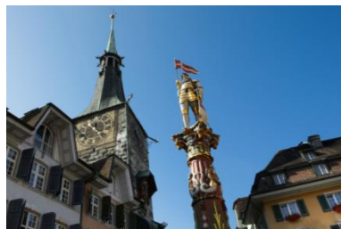
St. Ursen church and market place